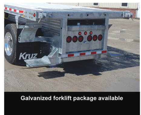
Galvanized forklift package available