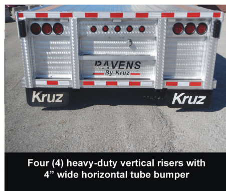
Four (4) heavy-duty vertical risers with 4" wide horizontal tube bumper