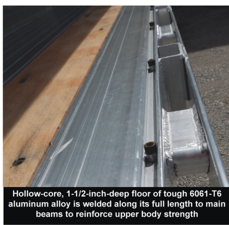
Hollow-core, 1-1/2-inch-deep floor of tough 6061-T6 aluminum alloy is welded along its full length to main beams to reinforce upper body strength