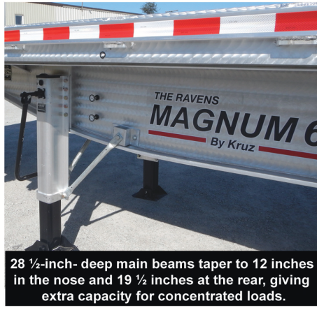
28 1/2-inch-deep main beams taper to 12 inches in the nose and 19 1/2 inches at the rear, giving extra capacity for concentrated loads.