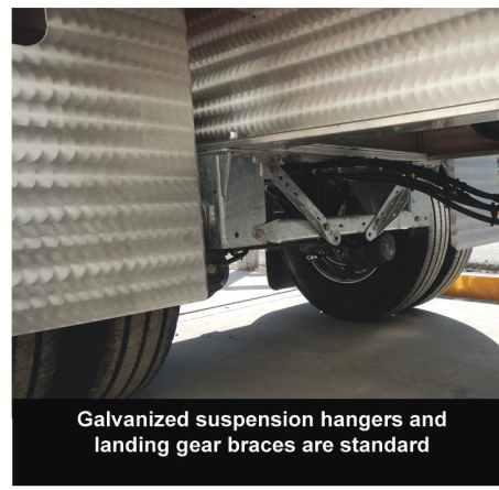
Galvanized suspension hangers and landing gear braces are standard